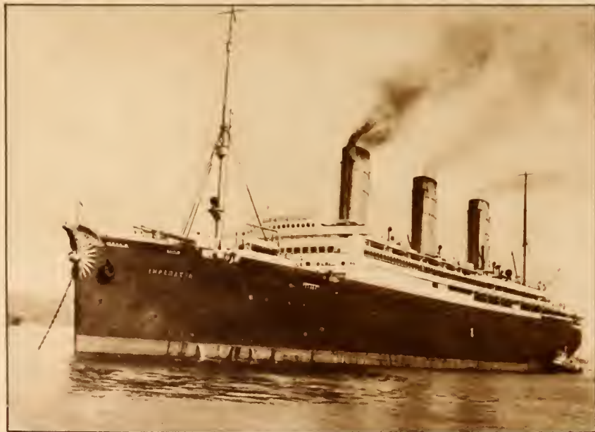
S. S. IMPERATOR is now a part of the Cunard Line's great fleet.